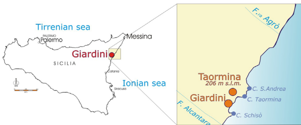
Fig. 1 - Location of the coastline of Giardini Bay.

Two municipalities insist on the Giardini Bay: Taormina and Giardini Naxos. Taormina is one of the most famous seaside of the Jonian sea, known for his archeological treasure (Greek theatre), night life and famous international film festival; Giardini Naxos is the “beach” of Taormina, but it lives its own life, with its numerous hotels and restaurants which guests more than 1 million tourists per year.