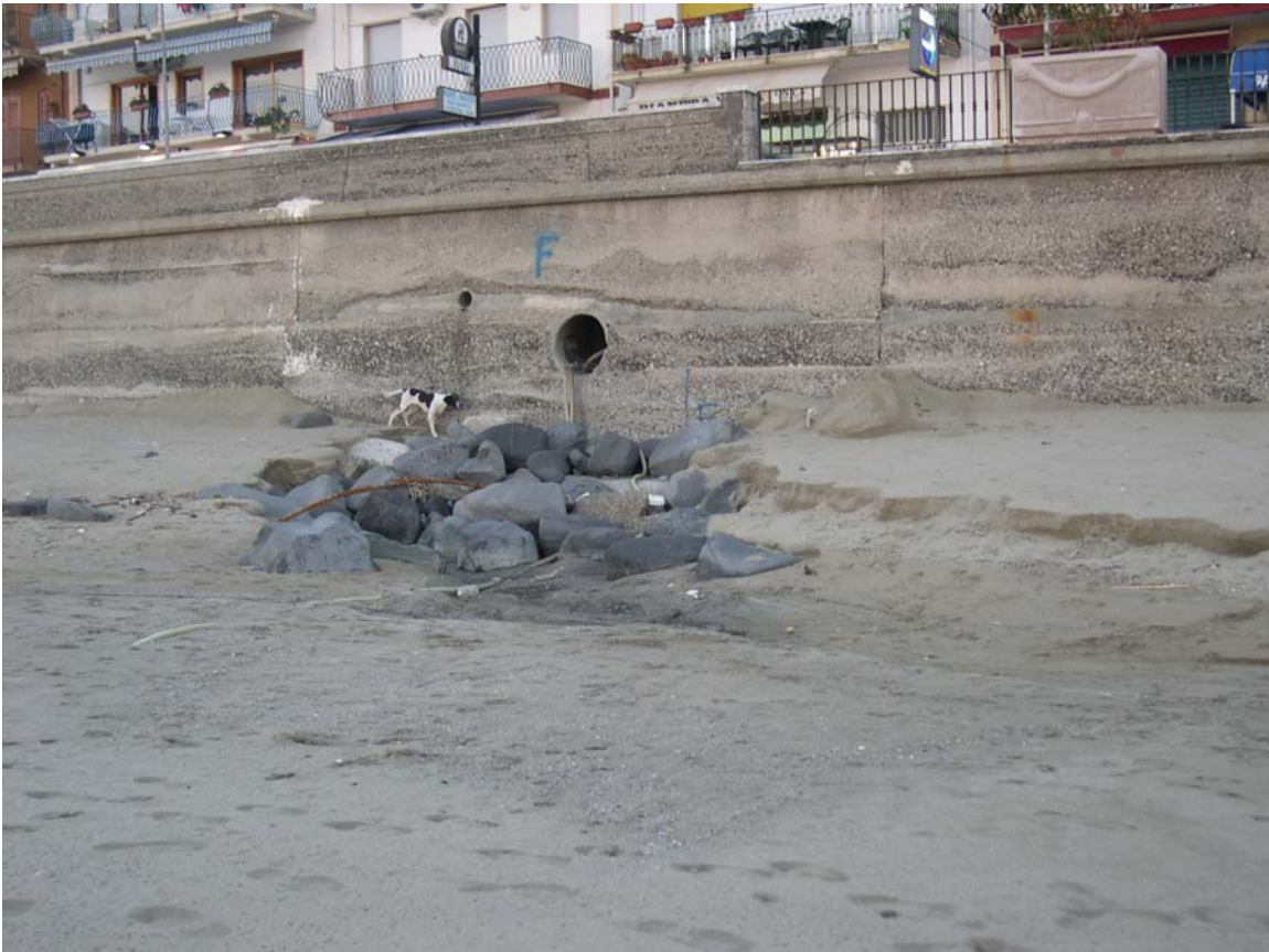
Fig. 4 – White waste water tube.

About weathering, it is interesting to note the action of the discharge of the pluvial water trough tubes located along the promenade (seawalk) which give rise an eroding action concentrated on the emerged beaches. This action, concentrated in the few points of the water discharge, cause the erosion of part of the beaches.